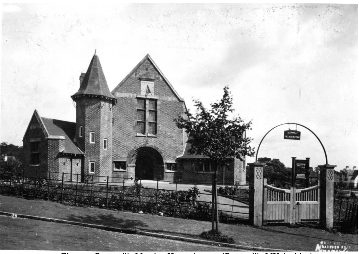
Figure 1: Bournville Meeting House in 1907

an organ in 1915 by George and Elizabeth Cadbury; following this the meeting house was referred to as a 'Quaker Cathedral'.