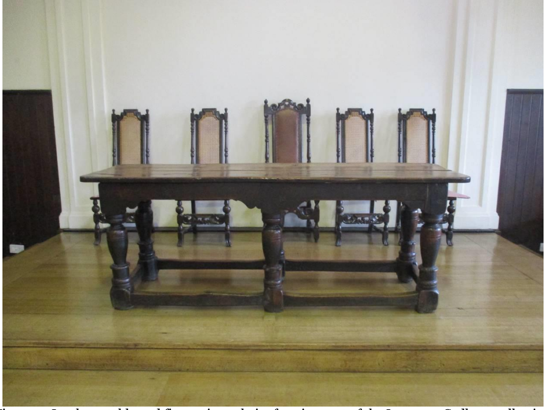
Figure 4: Jacobean table and five antique chairs forming part of the Laurence Cadbury collection based at Selly Manor

The meeting house contains a Jacobean table and five chairs on a platform which are part of the Laurence Cadbury collection based at Selly Manor.