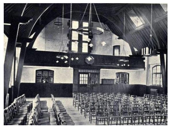
Figure 2: Interior views of meeting house in 1906